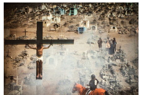
'Pinochet...' (S. Castilla, 1974), La Espera (M. Braniff, 1989), 'Pichqa minutukuna...' (C. Galindo, 1992)